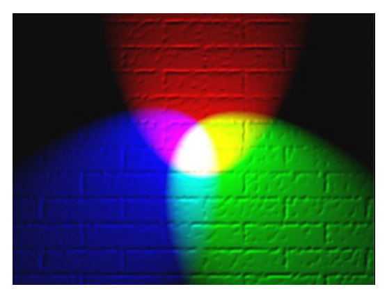
Red, green, and blue visible light combine to make white light.

Filters block certain energy levels of light while allowing others to pass through. Different colors of visible light have different levels of energy, running from lower-energy red to higher-energy purple. In this activity, the red and blue colored filters changed how those colors appeared on the white paper versus the black paper, and highlighted different elements in the space pictures. When you hold up the red filter to your eye, only red light makes it through. Red light reflects off both the pink colored marker (pink is a