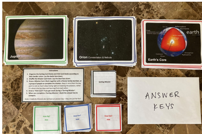
Printed Sorting Card Game