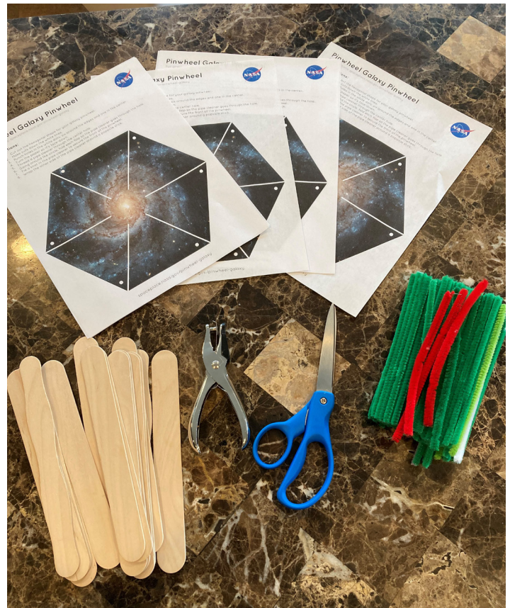
Pinwheel Galaxy materials